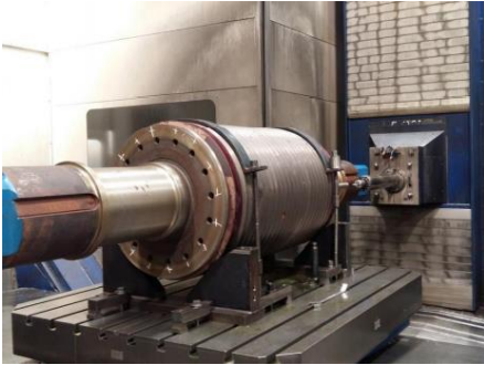
Longitudinal Shaft Drilling High Drainage Roll (Lotus)