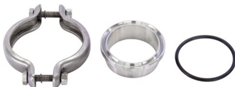
Clamp Weld ring O-ring